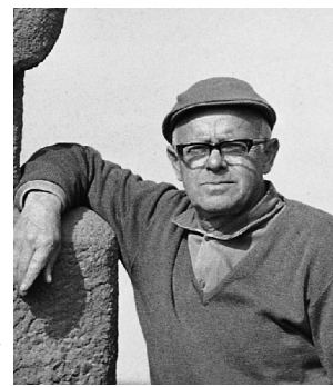
Sigurjón Ólafsson 1908 – 1982

Sigurjón Ólafsson Museum Laugarnestangi 70 105 Reykjavík www.LSO.is - LSO@LSO.is February 2007